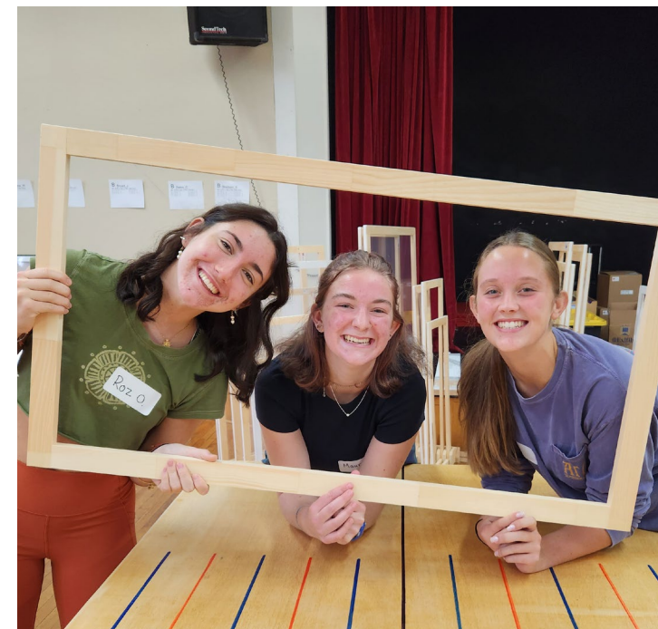
Building window inserts for weatherization at the 2023 Town of Orono Community Window Insert Build

Establish expanded financing structure - Work with Efficiency Maine to develop a funding structure whereby